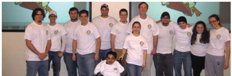
Students with newly received AMICI shirts reflecting the NEW LOGO.