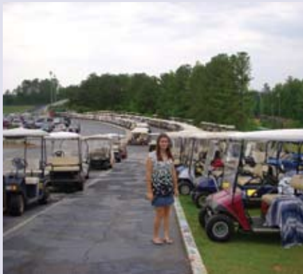
Is this a golf course parking lot or a school parking Lot? If you chose school you'd be correct. This "commuter" school is located in Peachtree City, GA.

Peachtree City, GA, a unique city located just thirty minutes south from Atlanta, provides more than 90 miles of cart paths for its residents to walk, run, ride their bike, or even drive golf carts. With over 9,000 golf carts registered, children at the age of 12 can drive the golf cart with a parent, and when they turn 15, they can drive the golf cart alone once they have acquired their learners driving permit. Freshman and sophomores attending McIntosh High School drive their golf carts to school and park them in a separate parking lot made especially for golf carts. This golf cart parking is probably the only one of its kind at any high school in the country.