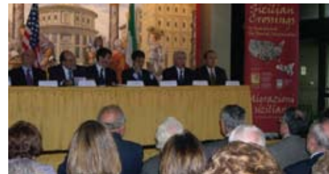
The audience listened intently to the Sicilian Crossing expert panel.